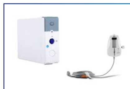
BLT Drip Module for Infusion PUMP