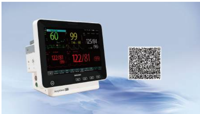
QR Code Export