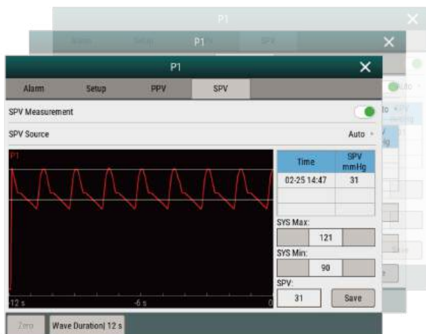
Heart Rate Variability

G series includes new parameters such as SPV (Systolic Pressure Variation) and HRV (Heart Rate Variability), enhancing hemodynamic and autonomic nervous system monitoring for more precise patient assessment.