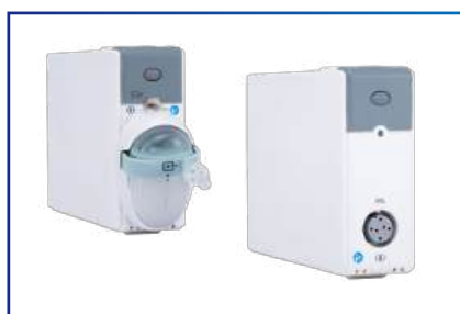
BLT Sidestream and mainstream Co2