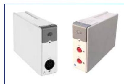
CO and IBP