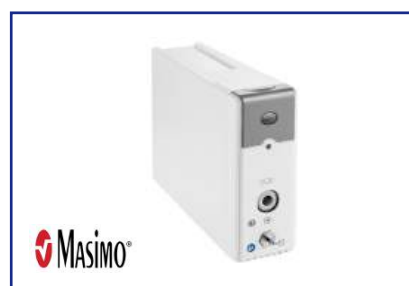
Sidestream CO2 + Mainstream)