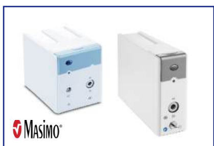
AG with and w/o O2 + Mainstream