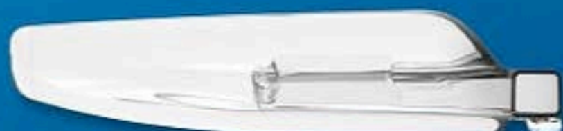
Blade size 4