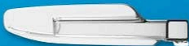
Blade size 2