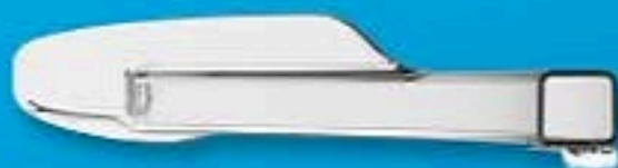
Blade size 1