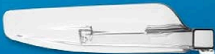
Blade size 3