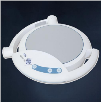
Control panel for On/Off and Lightness