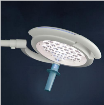
Handle for lightness