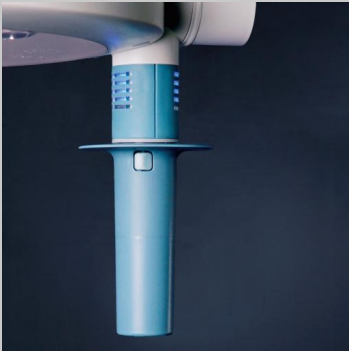
134°C removable and sterilized handle with lightness indication