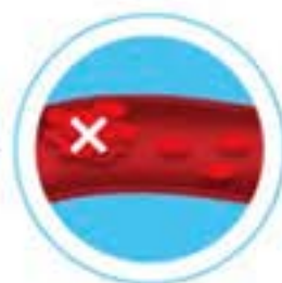
Prevent coagulation factor aggregation