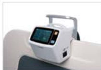
Unique clasp design, can be fixed in different positions.