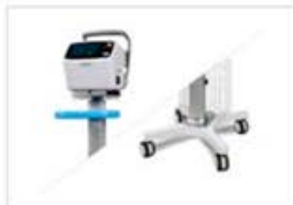
Trolley solution with slant casters and accessory storage box for daily movement