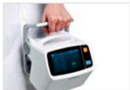
4.3-inch LCD touch screen with a clear display

SCD600 features a compact body and unique clip design for handy and intuitive control experience. All of this allows for greater flexibility and comfort for both clinicians and patients.