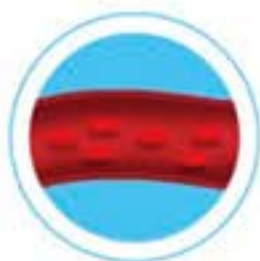
Promote blood circulation