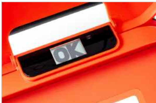
Simplified Status Monitor

This promotes user awareness and guarantees reliable use of the HeartSave Y I YA .