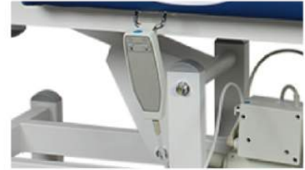
Hand controller; keep qualified after 2000 times use.