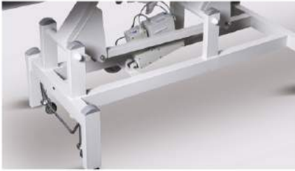
1.2-1.5 mm Thickness powder coated steel frame, 150 kg bear loading

LEADING BRAND OF CHINA MEDICAL FURNITURE