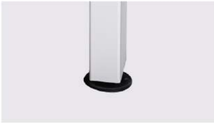
Engineering ABS material plug, foot pad