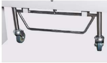
2 pcs 2' Hidden castors, 2 pcs 2' universal wheels