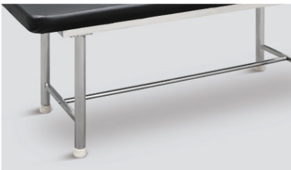
1.2-1.5 mm Thickness powder coated steel frame, 250 kg bear loading