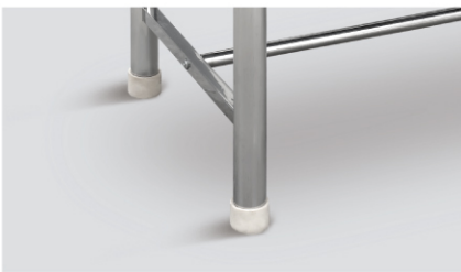
4 pcs Anti-slip bed feet covers